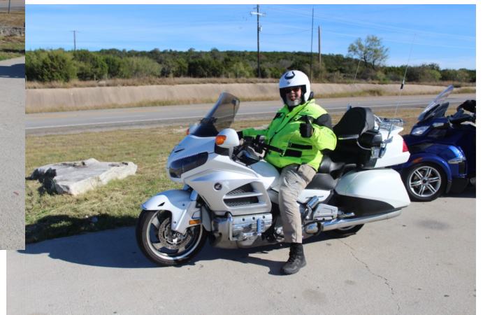
CENTEX Wings Chapter Ride—13 Nov 2021