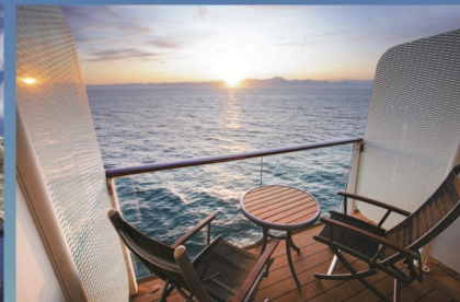
Sample Balcony picture