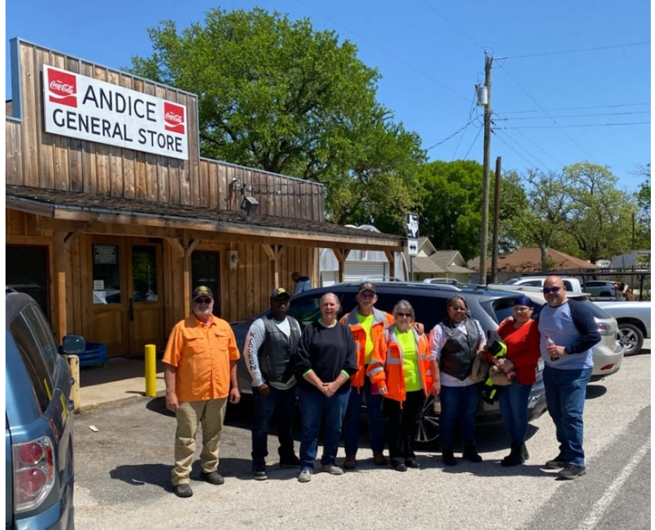
Chapter T Ride, Saturday 10 April 2021.

The Wingnut has been vaccinated and is ready to ride!