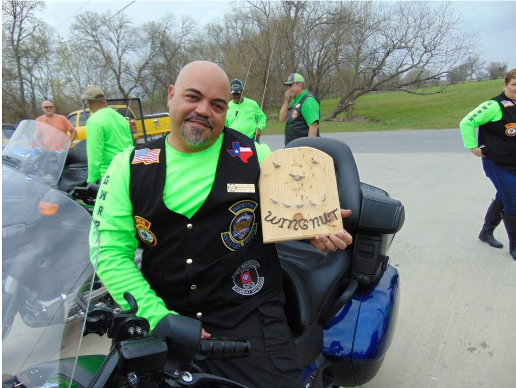
Wing Nut Award

Greetings. So here's my story. My wife gave me a small assignment with some pretty specific how-to instructions. She says, "Build me a platform for the laundry room so I can have the washer and dryer off the floor. Oh, and make sure I have enough room to store things underneath." No problem. I went to Lowe's and had all the wood precut and decided to add a few more inches to leg portion which joins the two platforms. I figured this will more than adequately accommodate laundry detergent and whatever else the queen desires.